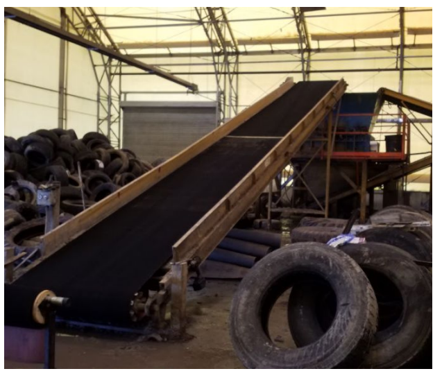
Contact us at:

sales@bolderindustries.com www.bolderindustries.com