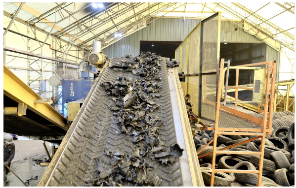
Bolder Industries' Maryville facility uses over 600 feet of conveyor belts.

*Yahoo Finance, 2020 **MarketWatch, July, 2020